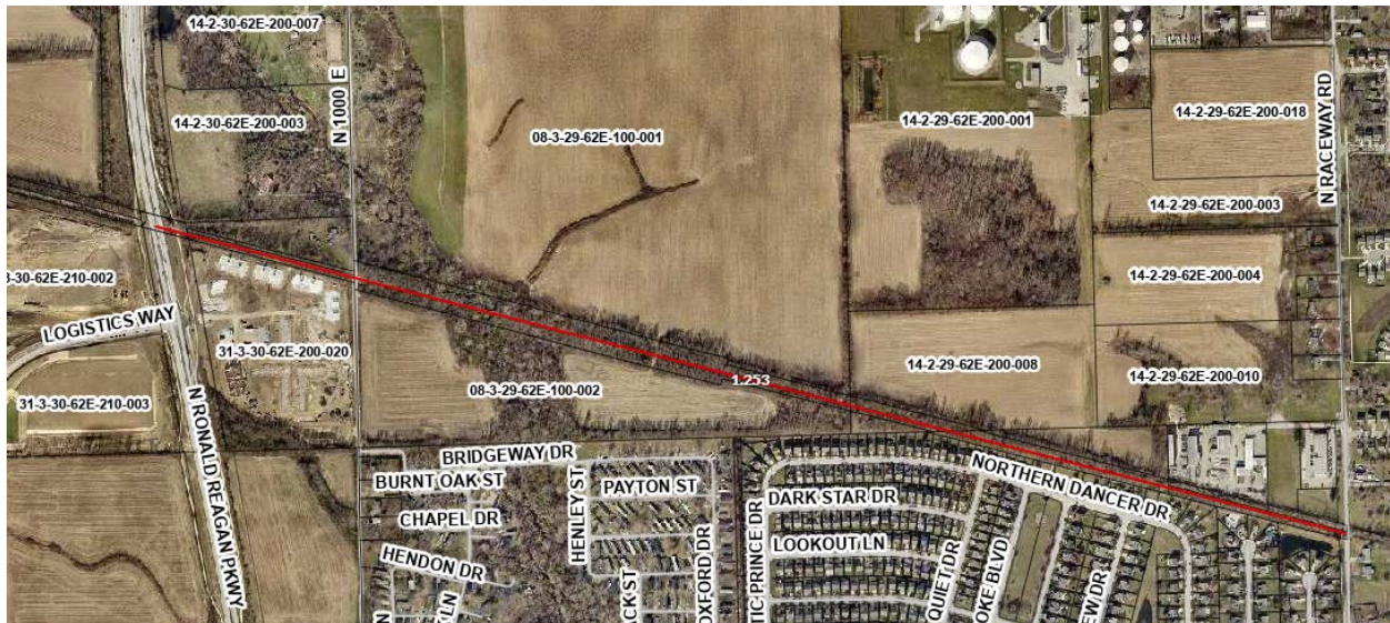
B&O Trail highlighted in red between N. Ronald Reagan Parkway and N. Raceway Road to the east.

Staff requests authorization from the Park Board to proceed, alongside Town administration, in negotiating, finalizing, and executing a donation agreement with the B&O Trail Association.