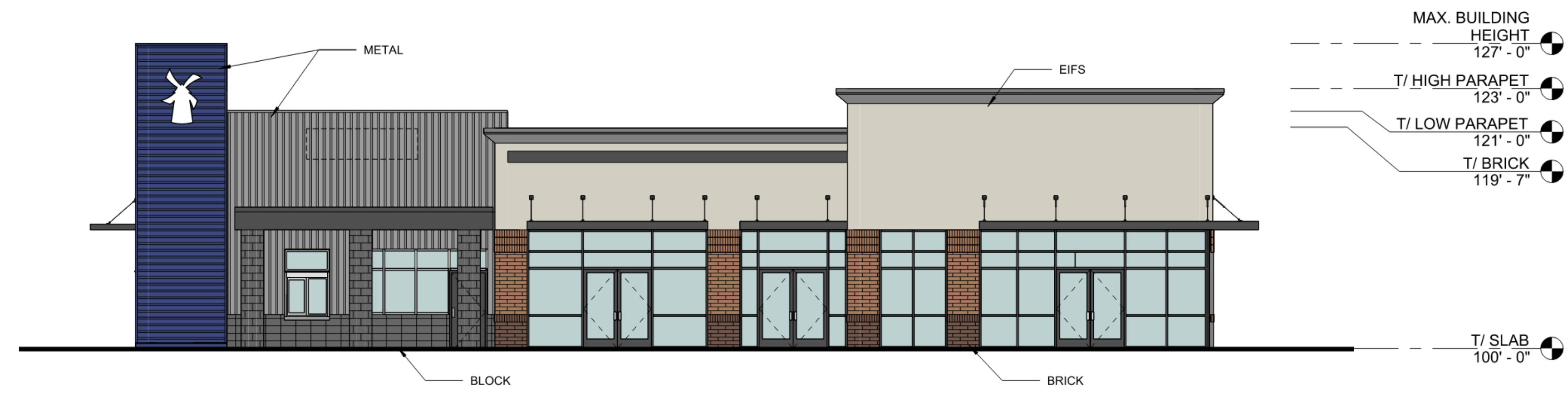
1 A201 1/8" = 1'-0"